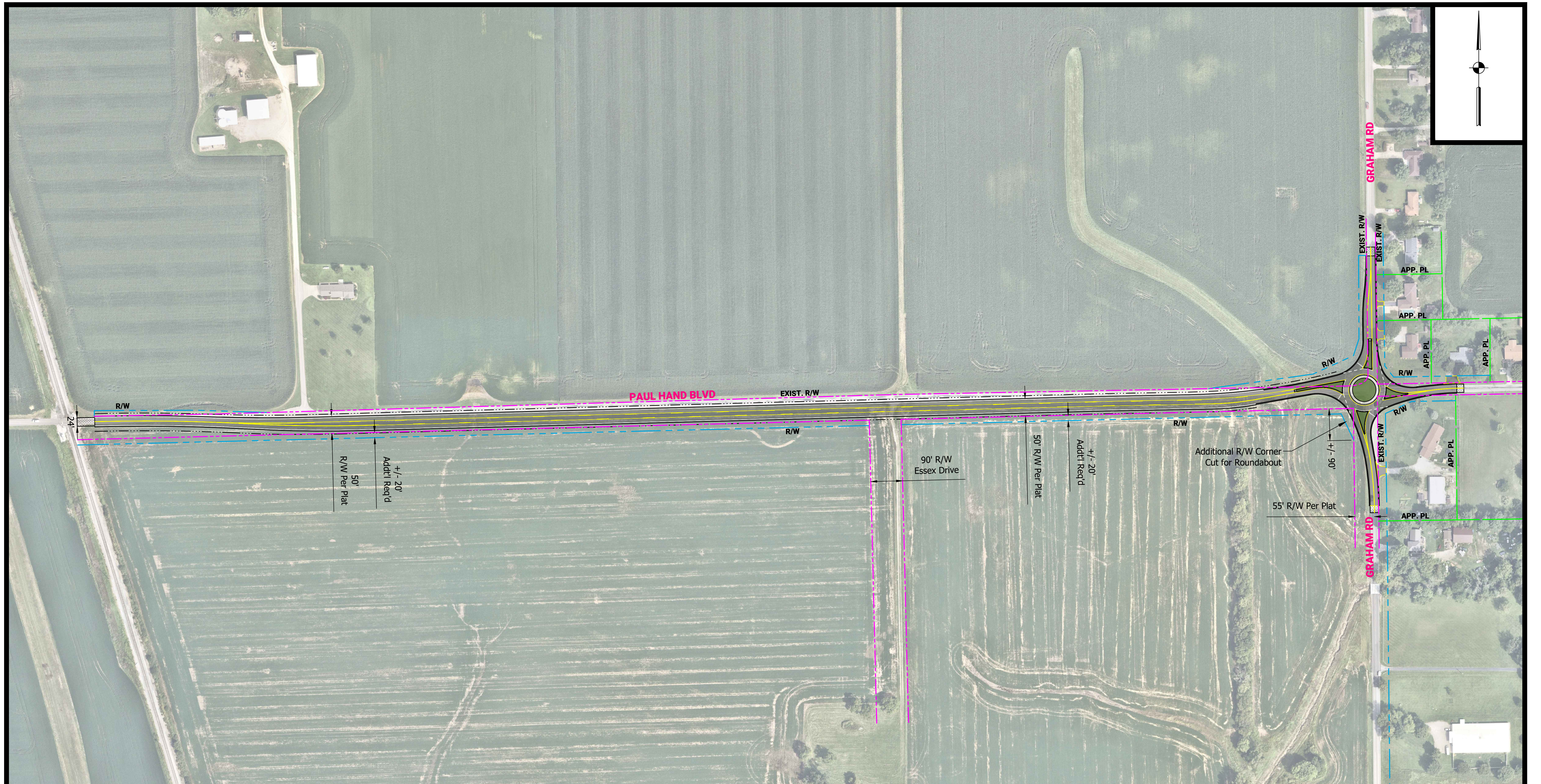
EXHIBIT C CITY OF FRANKLIN ROUNDAABOUT AT GRAHAM RD & PAUL HAND BLVD