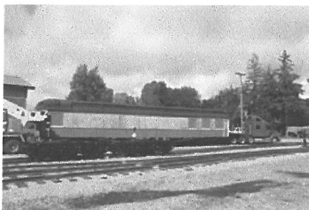
Backing into position for unloading