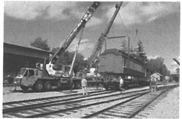
In the air