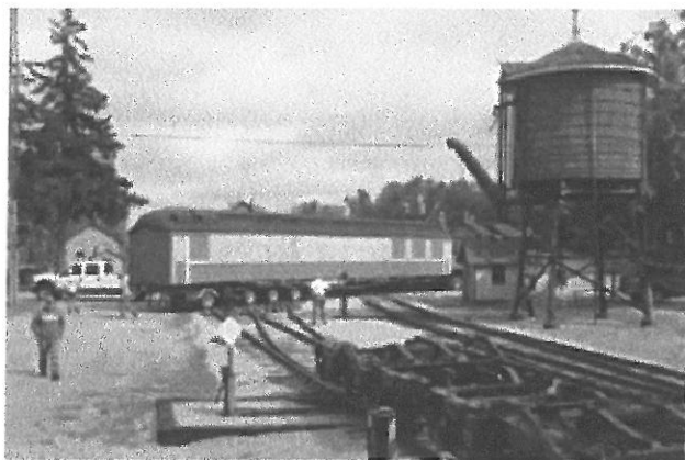
Backing into position for unloading