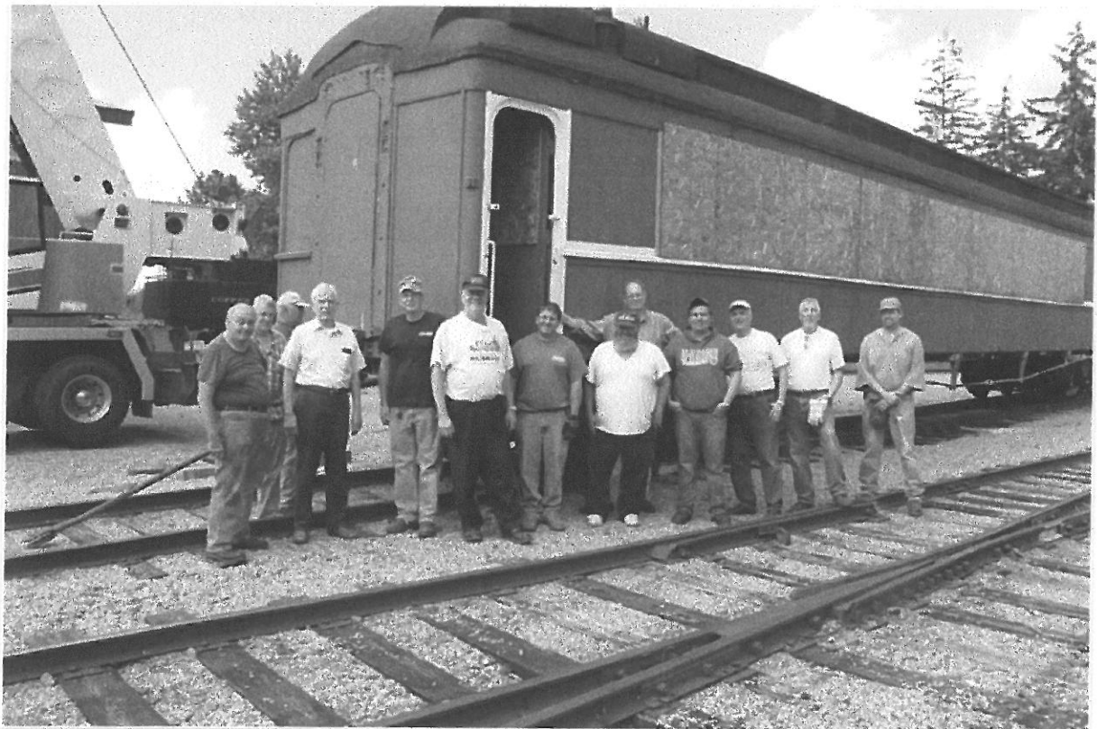
The team helping unload at North Freedom.