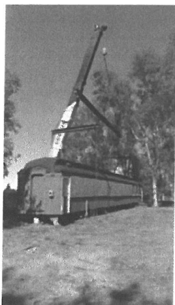
The crane in position for lifting the DULUTH