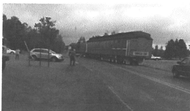
Just getting underway.... near Calumet, MI