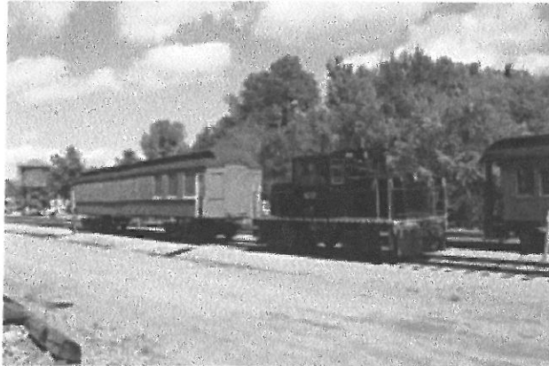
On the rails once again