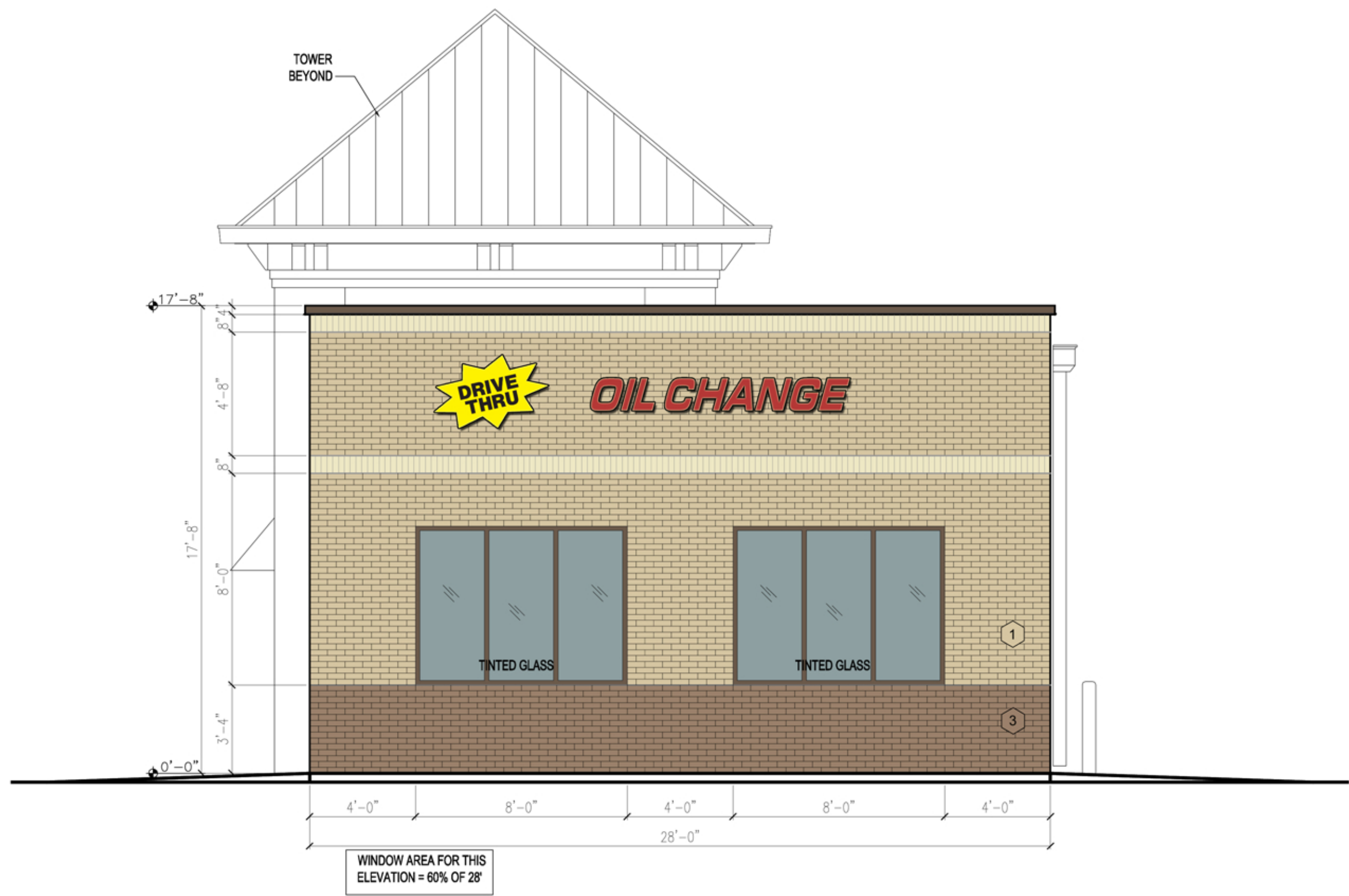
3 WEST ELEVATION A-200 1/4"=1'-0"