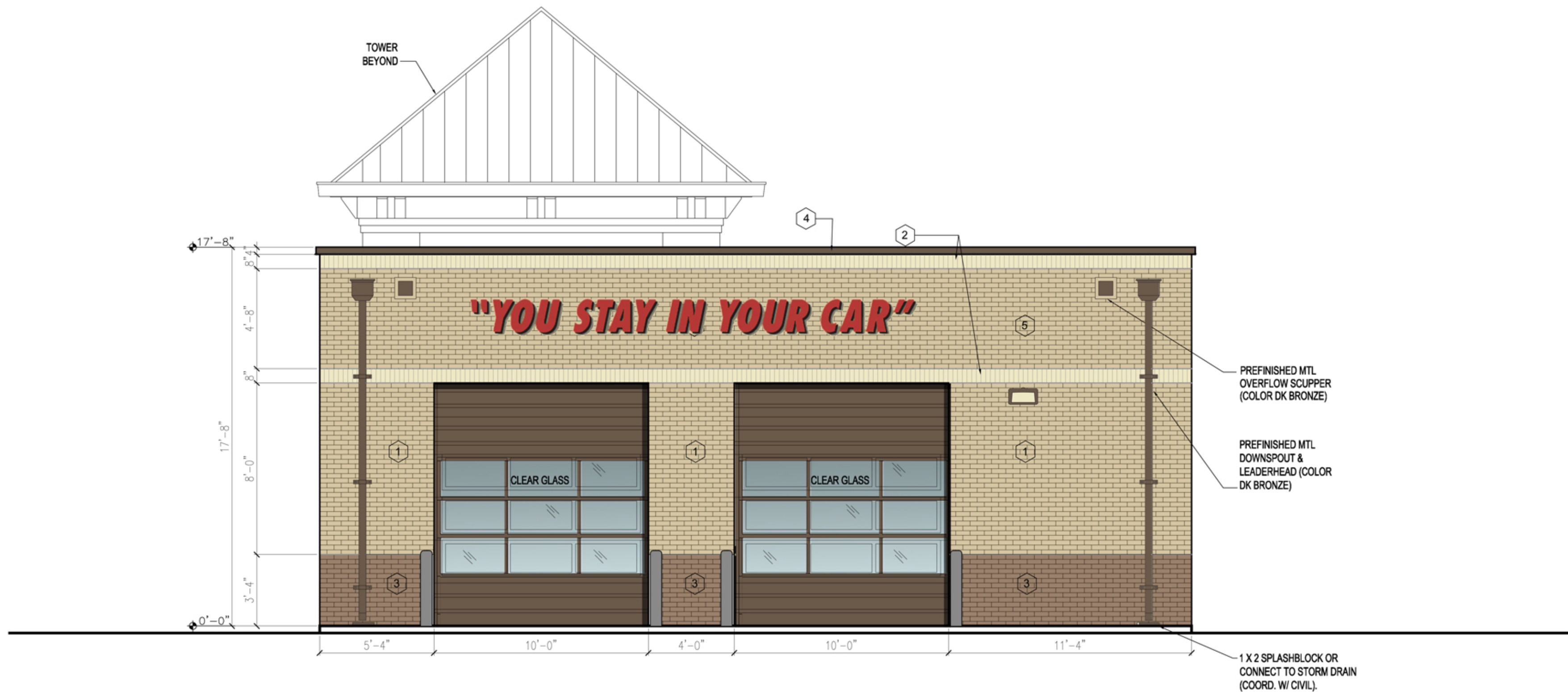
1 SOUTH ELEVATION A-200 1/4"=1'-0"